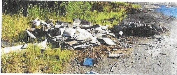
Trash should not be mixed with yard waste.

Delaware's yard waste ban is designed to conserve our landfill space as well as make yard waste available for other uses such as mulch.