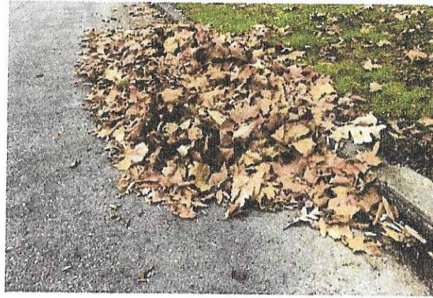
Leaves piled along the curbside for pickup.

These pick-up and drop-off options can make managing yard waste easy for Delaware residents.