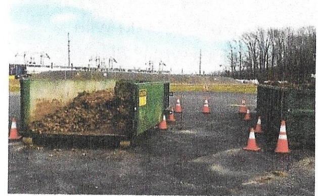
Yard waste collection bins at a drop off site.

and ask if they offer yard waste pickup for a fee.