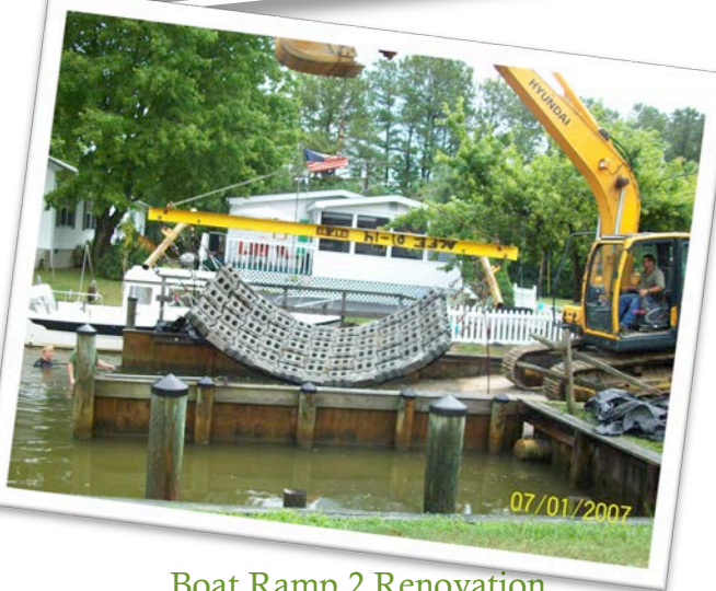
Boat Ramp 2 Renovation

Security cameras have been added to our entrance sign, 4-way stop, the clubhouse, playground, pool, and office. Security and office personnel can monitor activity. The cameras discourage vandalism and theft among other crimes.